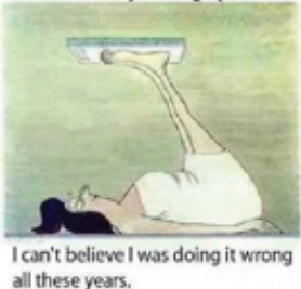
The correct way to weigh yourself:

We must admit that, despite our problems, worries and everyday difficulties, when we laugh, play, and have fun with others life becomes more enjoyable but also helps us solve problems, connect with others, and be more creative. People who add humor to their daily lives find that it stimulates them and makes them more optimistic about life and its hardships.